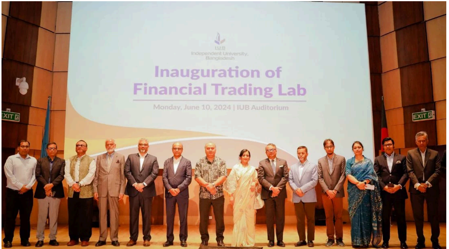
The image shows IUB representatives and guests posing for a photo at the campus on Monday, June 10, 2024.