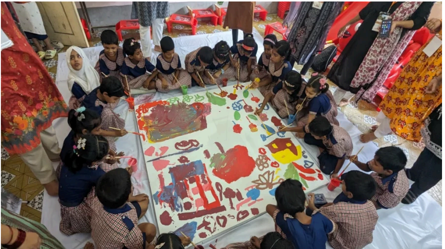
A group of children participating IUB Art Club's annual flagship event "Chalanta Canvas- Tour for a Cause" recently.