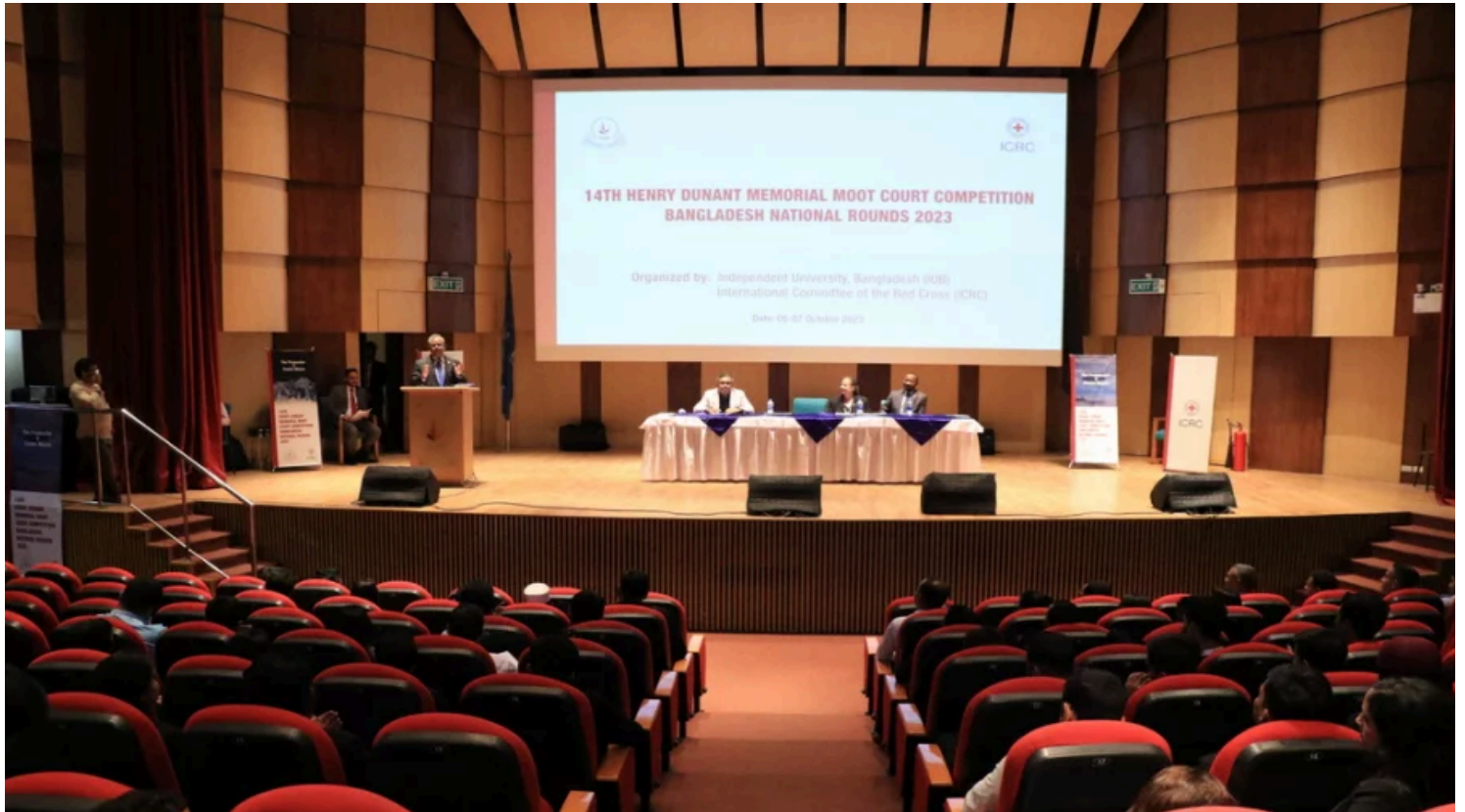
Speakers address the participants of the 14th Henry Dunant Memorial Moot Court Competition on international humanitarian law (IHL) at the Independent University, Bangladesh (IUB) in Dhaka on Thursday, October 5, 2023.